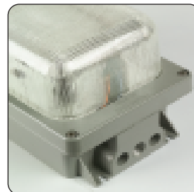
Integral mounting feet