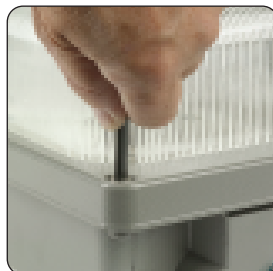
Screwed bezel fixings